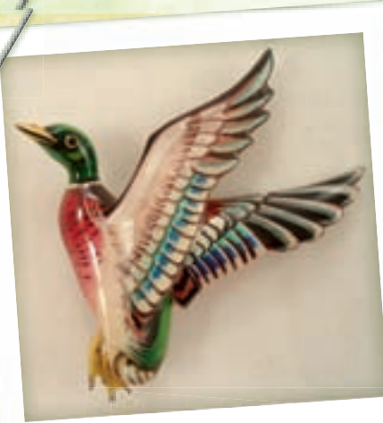
Close view of the larger mallard duck with his colorful in-flight wings.

Pair of Takahashi flying male mallard duck pins with colorful hand-painted details and rare wrapped feet. Top left: 2½"x2¼" flying duck pin with thin, streamlined head. Bottom right: Large 3"x3" flying duck pin with especially colorful wings. Both birds have three-toed wire feet wrapped in yellow cord to simulate the look of webbed duck feet. Takahashi wrapped feet are rare and an indication these are early examples of Takahashi art. Priceless heirlooms.