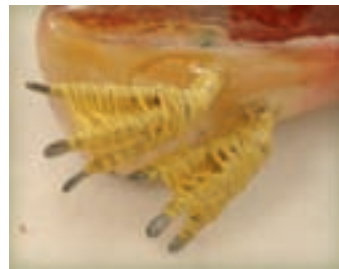
Detailed photograph of the rare wrapped duck feet.