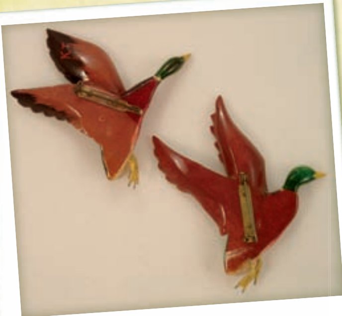
Back view of the birds. Note that the top left mallard duck pin is signed "K.T." in red. Kiyoka Takahashi signed only a few top-quality birds.