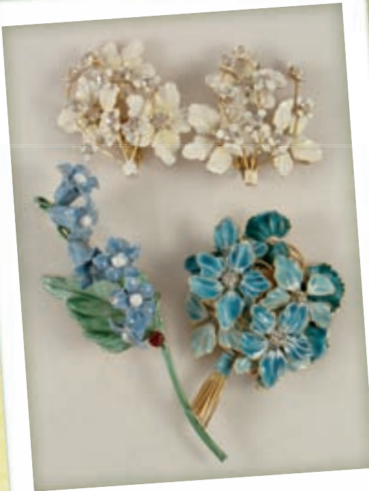
Enameled earrings and brooch

The 1 1/2" white enameled clip earrings at the top of the picture are one of Carol Benjamin's favorite pieces. $35.00 – 75.00. Bottom left: 3 1/2" brooch with two varieties of blue enameled blooms. Notice the Siam rhinestone artistically placed at the base of the flowers. $35.00 – 75.00. Bottom right: 2" Sandor blue enamel spray pin with a blue enamel wrap. All three pieces likely date to the 1950s – 1960s. $75.00 – 150.00.