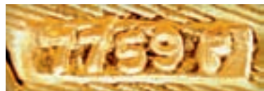
Boucher inventory number 7759P.