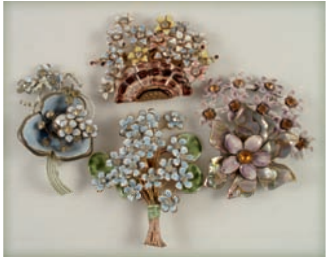
Enamel and rhinestone brooches

Four Sandor enamel and rhinestone brooches. Top: 1950s Sandor 2 3/4"x2" basket pin with blue, pink, yellow, and white enameled flowers. $75.00 – 150.00. Right: Sterling silver late 1940s Sandor 2 3/4"x1 1/2" blue enamel and rhinestone flower pin. $150.00 – 300.00. Bottom center: Wonderful 2 3/4"x2 1/2" blue enameled 1950s flower pin with green enameled wire wrap. $75.00 – 150.00. Bottom right: 1950s Sandor 2 1/2"x2 1/2" flower pin featuring unusual abalone petals. $75.00 – 150.00. (Courtesy of Janet Abby and Carol Lynn Benjamin)